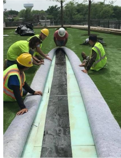
2.0 inch with Turf Installed