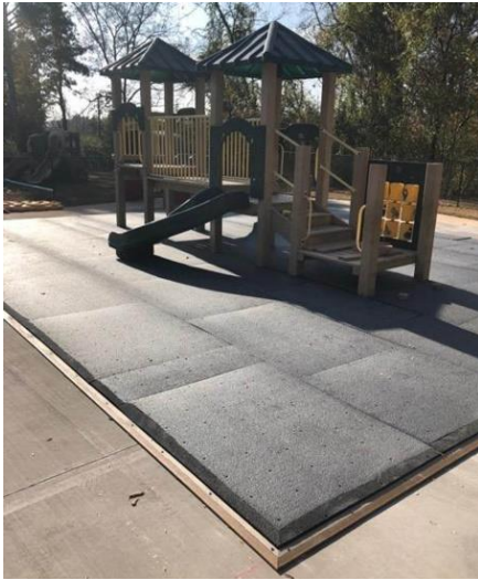
1.5 inch with Beveled Edges

The cleanup from a Turf Cushion installation is extremely easy and efficient. Any scrap cuttings can be easily gathered up for disposal or recycling.