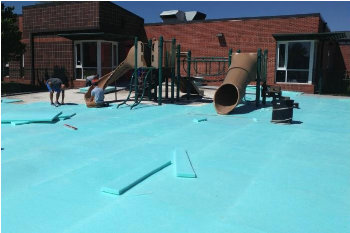
TurfCushion® 2.0 inch installed in Brick Type pattern.